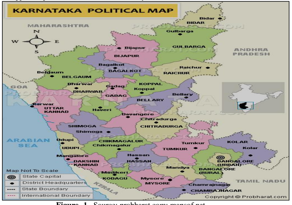
Figure -1